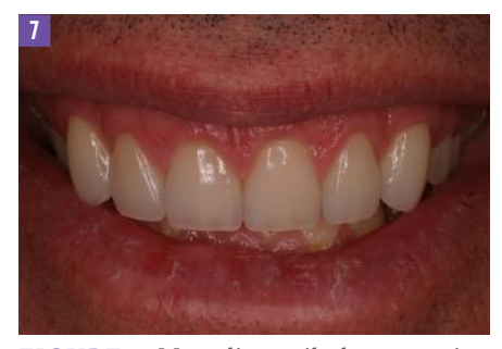
FIGURE 7: Masculine smile demonstrating straighter incisal edge form with more angled distal incisal edges into the contact zone