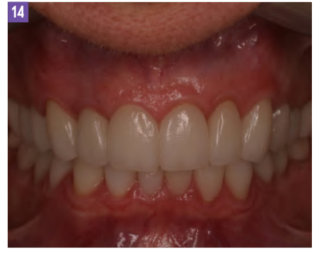
FIGURE 14: Retracted view of feminine teeth with closer set mesial and distal facial line angles