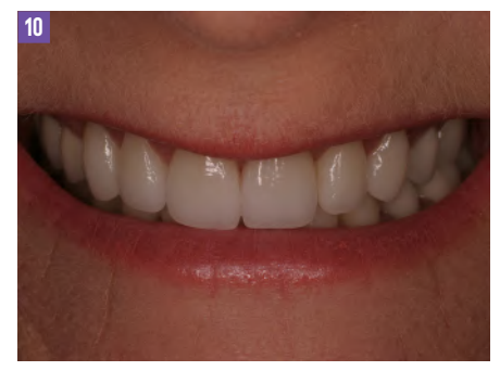
FIGURE 10: Feminine teeth with shorter mesial and distal contact zones

When done in this fashion, the patient's aesthetic transformation will further improve their confidence and, in trans individuals, help to transition them to the degree they seek for their personal growth and development.