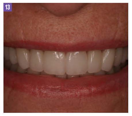
FIGURE 13: Feminine teeth with closer set mesial and distal facial line angles

of a person's gender, sexual preference, or transitional status.