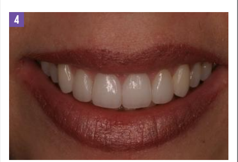
FIGURE 4: Smile illustrating ideal facial gingival contours and design of the centrals to cuspids