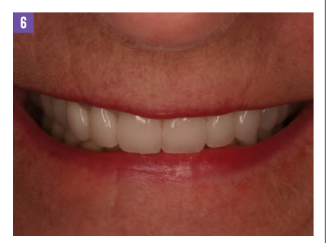
FIGURE 6: Feminine smile with normal centrals to fit the given arch form space