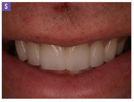
FIGURE 5: Masculine smile with larger centrals to fit the given arch form space