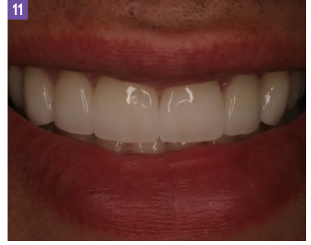
FIGURE 11: Masculine teeth with wider set mesial and distal facial lines