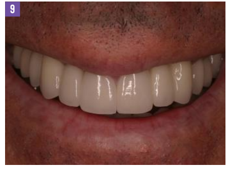
FIGURE 9: Masculine teeth with longer mesial and distal contact zones

Whether performing smile changes in a trans patient or a non-trans patient, proper pre-treatment planning and case preparation is