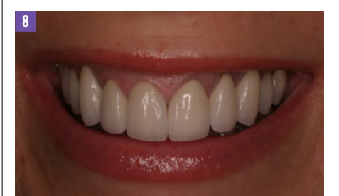
FIGURE 8: Feminine smile demonstrating softer incisal edge form with more rounded mesial and distal incisal edges into the contact zone