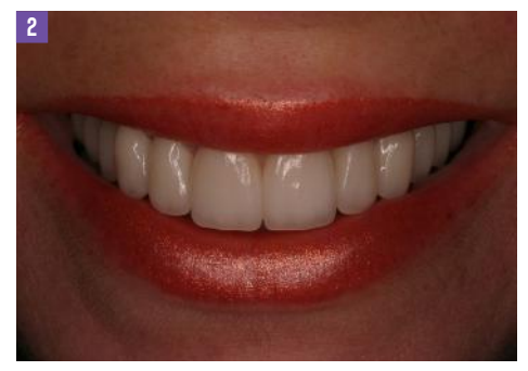
FIGURE 2: Smile demonstrating more feminine features for this individual

Nelson Y Howard shares considerations in evaluation and the care and treatment of cosmetic dentistry transformations for transgender patients